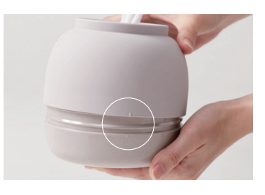
Use the dots to match the top and bottom components together.