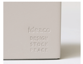
Logo on the bottom.