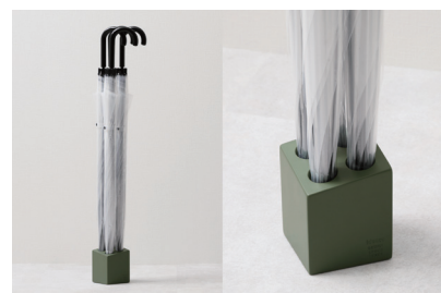
4 umbrellas can be stored upright.