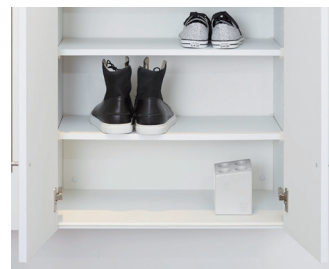
Compact size. Small enough to store away when not in use.