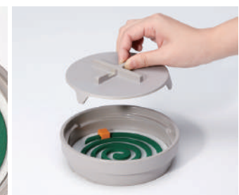
The lid can be closed after the coil for your convenience to avoid making a mess.