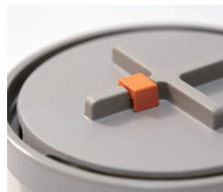
The lid fits extinguishing fire device.