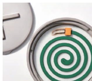
It can control the burning time of the coil only put the extinguishing fire device.